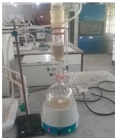
Figure 6: Extraction process