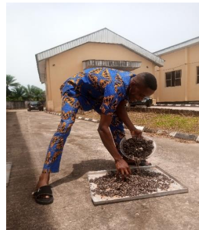
Figure 3: Cleaning of