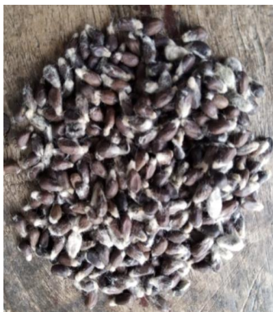
Figure 1: Cotton seed the sample

6.2. Sample Acquisition and Preparation: The cotton seed was obtained from HOTORO, KANO, NIGERIA. The seeds obtained was thoroughly cleansed in order to get rid of any agricultural residues and other contaminants.