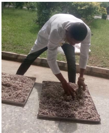
Figure 2: Sorting of cotton