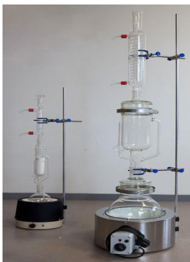
Figure 5: Soxhlet Extractor